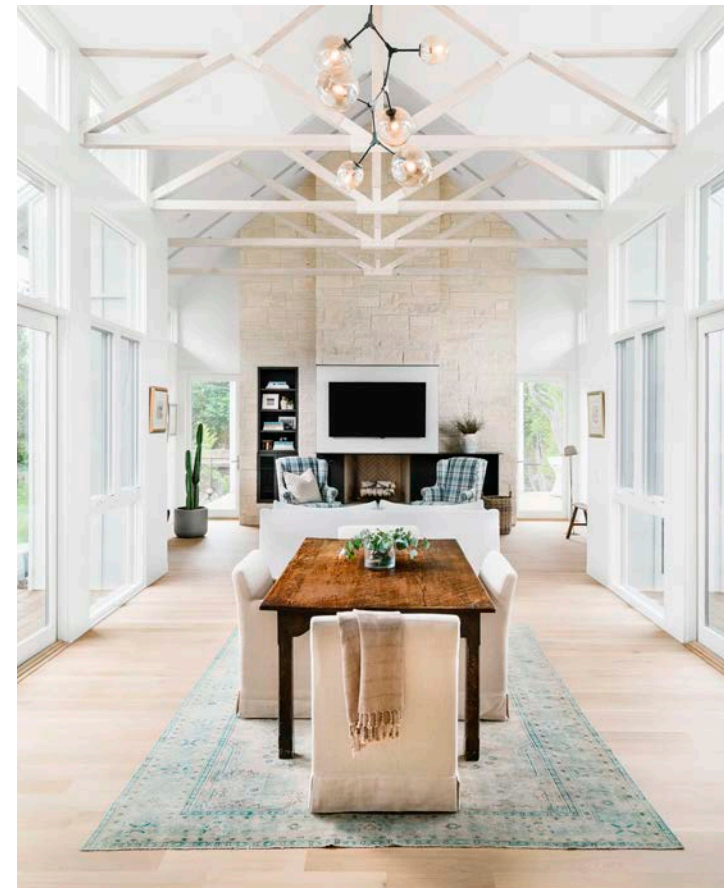
PHOTOS: RÖM ARCHITECTURE STUDIO; CHASE DANIEL (POINT B DESIGN GROUP)